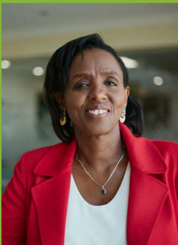
Dr. Agnes Kalibata

with Ceremony for the Justus-von-Liebig Award for World Nutrition to Dr. Agnes Kalibata